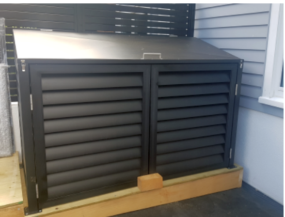
2 Bin Shed (120L/140L) - Louvre